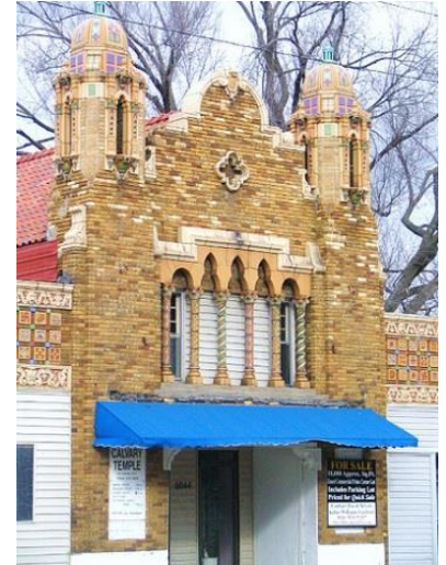
Aladdin Theater 6044 East Truman Road, KCMO

Unfortunately, only an insufficient number of formal protections prevents these forgotten gems from being lost forever. In the last few years several notable structures and cornerstones of this historic neighborhood, including commercial structures along Independence Avenue, have been lost, and many more are being threatened without the protection of a comprehensive designation that encompasses all of the eligible historic resources.