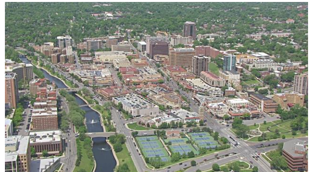
Country Club Plaza

The Country Club Plaza became the most influential comprehensively planned retail complex established in the United States before the mid-twentieth century. The shopping center established real estate developer J. C. Nichols as the nations' foremost author of a groundbreaking approach to the creation of a mixed-use district, an approach that significantly altered the American landscape after World War II. Today, hundreds of new apartments are proposed, approved and/or under construction in the area, particularly north of the Plaza. New hotel proposals emerge while simultaneous subsidies are sought, and the lodging community expands its offerings. Retail properties are constantly changing, and office use has grown in recent years. Due to increased development pressure, it's important that any new development follow the Midtown Plaza Area Plan closely in terms of land use, zoning, height, density, architecture and relationship to the area as a whole. These are all details that were carefully considered by the Plaza subgroup of the Midtown/Plaza Area Plan Advisory Committee. The City should enforce the plan and complete a comprehensive traffic study for the Plaza so that the impact on road and traffic can be fully understood and evaluated.