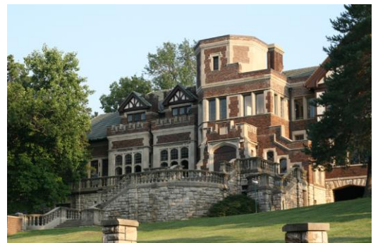
Epperson House 52nd and Cherry Streets, UMKC