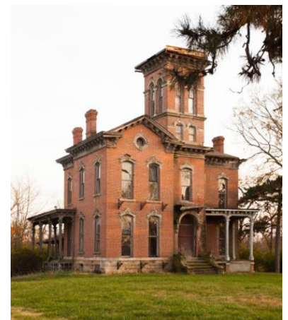
Sauer Castle, 935 Shawnee Road, KCKS