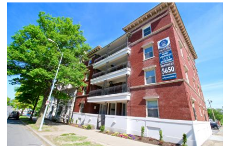
Juliet Apartments 1114-1116 E. Armour Boulevard