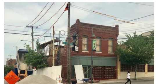
Mardi Gras Club, 1600 E. 19th St.

Recently designated as a City of Music by UNESCO, 18th and Vine is internationally recognized as one of the cradles of jazz music. Many notable jazz musicians of the 1930s & 1940s made 18th and Vine their home base, including Count Basie, Charlie Parker and Jay McShann. The Historic District had long suffered from a lack of private investment and building neglect. Since the 1990s when redevelopment efforts began, several historic buildings have been lost and many more sit vacant and deteriorating, such as the Mardi Gras Club, 1600 E. 19th St., and the Holy Ghost New Testament Church (the historic Jamison Temple C.M.E. Church), 1815 Paseo.