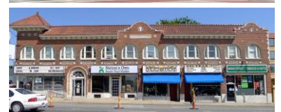
Main Street Corridor