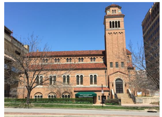
7th Church of Christ, 604 W 47th St

This important religious structure is not protected, putting it at increased risk for demolition. Any and all alternatives to demolition should be explored. Options for the most sympathetic reuse possible of the historic church could include: reuse as a place of worship by another denomination, cultural or educational purposes as a "social gathering" place, or a creative development plan that incorporates the historic church into a mixed-use development. Other cities such as St. Louis, have seen churches adaptively reused as offices for design firms, nightclubs and restaurants.