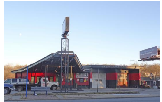
Phillips Service Station - Willy's Petroleum Co. - 5901 Prospect Ave.

The planned rehabilitation of Kemper Arena is an important milestone in efforts to increase awareness and preservation of Kansas City's modern architectural heritage. Yet, many other structures are still at risk. Threats include the demolition of buildings which are not yet widely understood to be significant and the removal or alternation of original materials that contribute to the design aesthetics of Modernism. A survey of Post-World War II architecture was recently completed by the City of Kansas City, MO. Of particular note is the Phillips Service Station - Willy's Petroleum Co., 5901 Prospect Ave. (currently Calley Tires), whose unique gull-wing design was built in 1963.