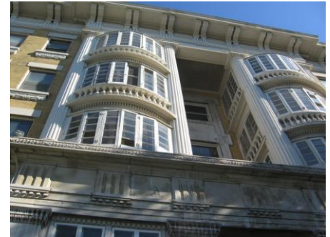
Chalfonte Apartments 1110-1112 E. Armour Boulevard